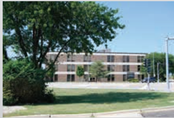
3801 West Lake Avenue: New location of administrative offices.