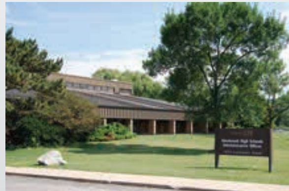
1835 Landwehr: Former administrative offices transform into classroom space for students.

The Glenbrook Evening School is an accredited high school that provides students in unique life situations an opportunity to obtain their diplomas during atypical school hours. There are 48 students currently enrolled at the school and more than 2,200 community residents have graduated since its inception in 1975. The school is currently housed at Glenbrook South.